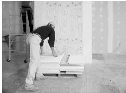
Many crews speed up the stacking by building a simple two-sided, free-standing frame. Note: Frame is not attached to pallet.

For more information on our recycling program, visit armstrong.com/ceilings/recycling